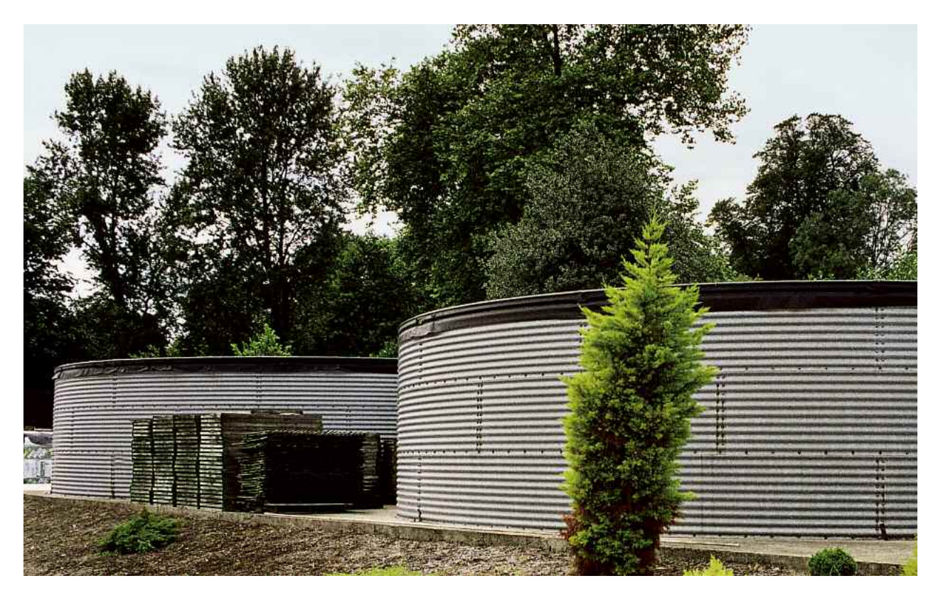
These two 36/3 200,000 litre capacity tanks are used for nursery irrigation.