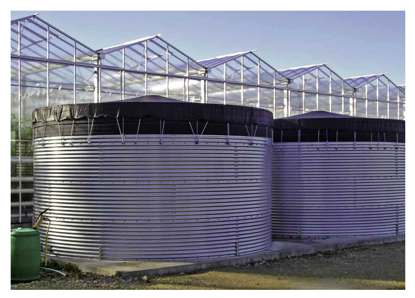
Rainwater run-off collection tanks installed by irrigation specialists Evenproducts.