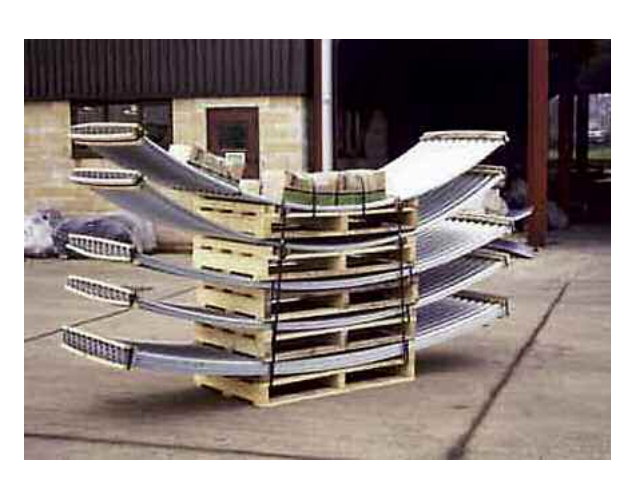
Tank kits are delivered on europallettes and include full instructions and fittings required for assembly.